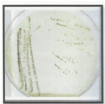
FIG. 2 TYPICAL COLONY CHARACTERISTICS OF STAPHYLOCOCCUS AUREUS